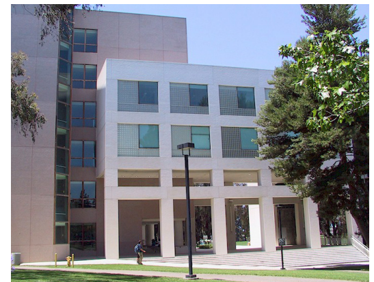
View of Pacific Hall.

In a CV system, variations in thermal requirements are satisfied by varying the temperature of a constant volume of air being delivered to a space. This works well under uniform heating and cooling requirements. However, when heating and cooling loads vary, CV systems continually supply peak capacity even when the demand is not at peak level. This method consumes a great quantity of energy to maintain peak flow in the central system.