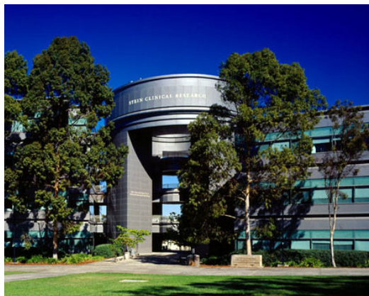
View of Stein Clinical Research Facility.

A comprehensive analysis conducted by engineering consultant Kuhn & Kuhn included a design review, spot checking of fan energy and flow readings, a lighting review, and an assessment of control system performance. Cost analysis was performed to determine the simple payback for installing variable frequency drives and upgrading building control systems to direct digital control.