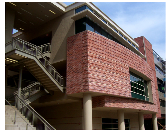
La Kretz is designed with an exterior main stairway and corridors to save energy.

The 350-seat auditorium on the first floor uses an energy-efficient displacement ventilation system. Low-velocity air is supplied to the space through floor-level vents. As the air