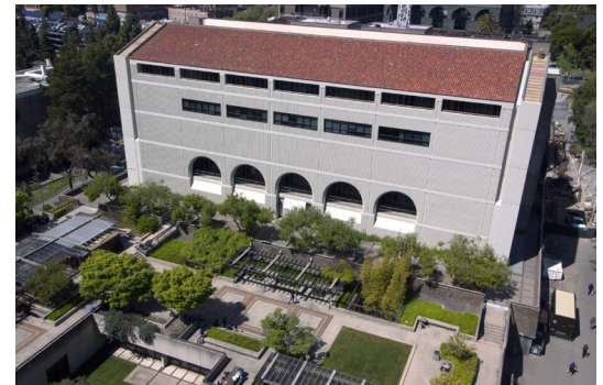
View of Davis Hall south elevation and courtyard.

commissioning agent with numerous data points and rich data early in the commissioning process. As one of the first steps in the MBCx process, new whole-building electrical and steam meters were installed to provide additional information that would be useful to document the energy baseline and verification of energy savings. Energy analysis performed by FDE revealed multiple opportunities for savings at Davis Hall. The three top energy measures were the replacement of failed variable speed drives, reduction of operating hours on the main air handling units (AHUs), and improved lighting control in the structural testing lab.